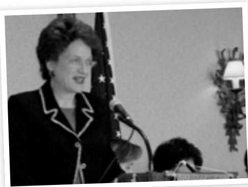
Chief Judge Kaye as she accepts the M. Dolores Denman Lady Justice Award for Lifetime Achievement.